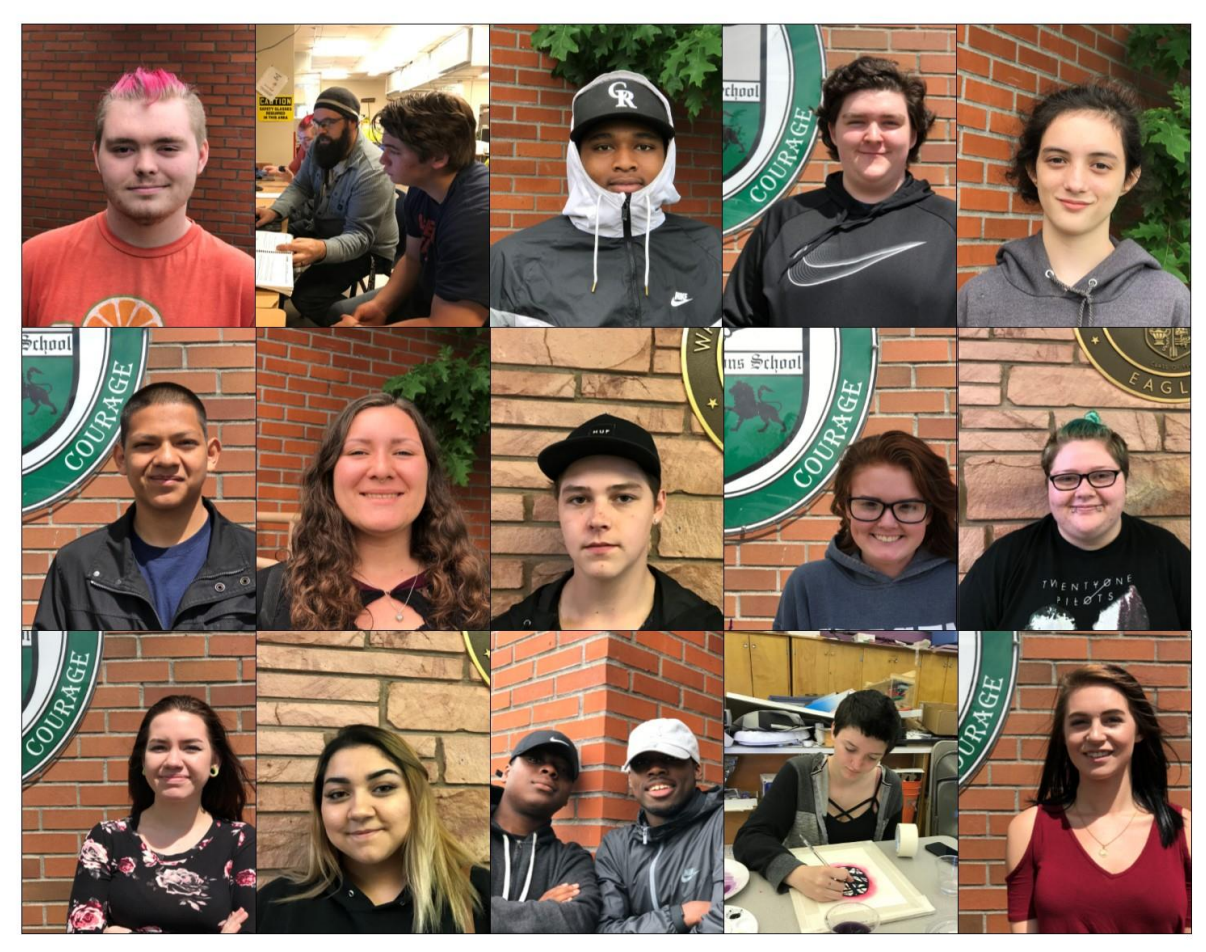
Portraits of some of the students we spoke with during our school visits.

The federal government also plays a large role. The new Every Student Succeeds Act (ESSA) provides federal funds that support students in poverty and other historically underserved groups. It also requires states to have an accountability system that meets certain requirements. ESSA gives states some flexibility in designing accountability systems and in identifying and supporting schools and districts that need improvement. Federal officials approved Oregon's ESSA plan in August 2017.