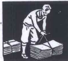
Newspapers: Fold them flat (the way the paper boy sells them) and tie them in bundles about 12 inches high.

PREPARE AND BUNDLE THE MATERIAL FOR SCHOOL COLLECTORS