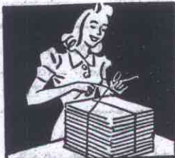
MAGAZINES AND BOOKS: Tie them in bundles about 18 inches high, so they can be easily handled for collection.