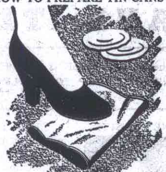
Cut out both top and bottom and flatten can.