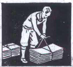
NEWSPAPERS: Fold them flat (the way the paper boy sells them) and tie them in bundles about 12 inches high.

Please Tie Bundles Firmly ( OVER ... TO SAVE PAPER )