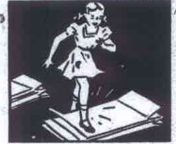
Corrugated and Cardboard Boxes and Cartons: Flatten them out and tie them in bundles about 12 inches high.