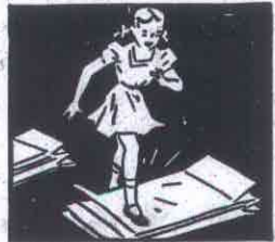
CORRUGATED AND CARDBOARD BOXES AND CARTONS: Flatten them out and tie them in bundles about 12 inches high.

A BUNDLE OF PAPER AND A BOX OF CANS IN FRONT OF EVERY HOME!