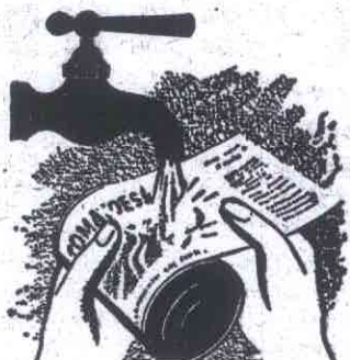
Clean and remove paper label